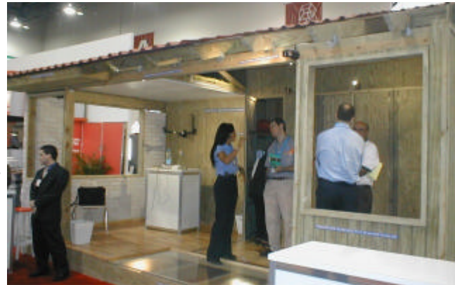
Softwoods Booth at 2002 EXPO CHIAC October, 2002

als, this year's booth featured a wall section using brick construction. This was done in order to showcase how wood roof systems work with