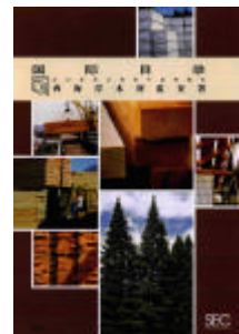
WCLIB Buyers Guide

The second publication is the new West Coast Lumber Inspection Bureau, (WCLIB) Buyers guide . The publications lists US