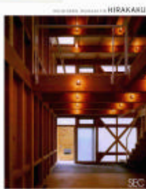
Douglas fir HIRAKAKU

SEC members have released two new publications for use in the promotional activities in overseas markets.