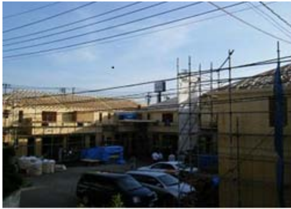
9-story apartment building during construction