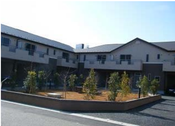
Completed apartment building