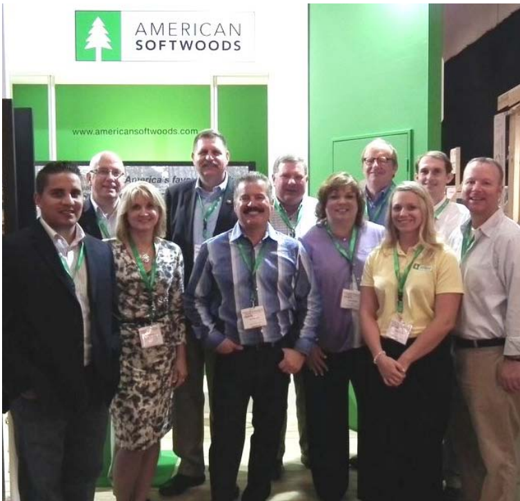
Part of the group at the Timber Expo in Coventry, UK