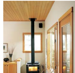
In this room, Hem-Fir is used for the ceiling, panelling, cabinets, mouldings and doors.