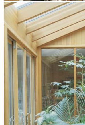
Hem-Fir's soft-toned colour remains light, even after exposure to UV rays. Panelling products in this species combination are both practical and elegant.