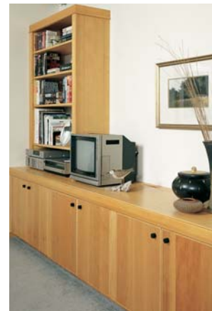
These cabinets showcase the subtle variations in colour among the Hem-Fir species.

Like all patterned products, solid wood panelling products reflect the grade of the starting appearance-grade material (as described earlier), adhering to similar requirements for permissible characteristics. In most cases, panelling products in Hem-Fir will be run-to-pattern from the exquisitely beautiful, clear and nearly clear Clears , Industrial Clears , Finish and Select grades. Whereas several grades of knotty panelling products are widely available in the Western pines, knotty grades in Hem-Fir are not as commonly remanufactured into panelling products.