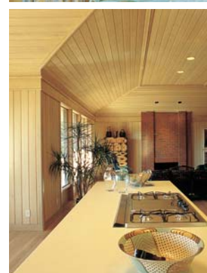
Opposite: Hem-Fir panelling products may be run-to-pattern from the exquisitely beautiful clear and nearly clear grades ( Clears , Industrial Clears , Selects , and Finish ) or from the higher knotty grades ( Select Merchantable and No.1 or No.2 Merchantable ). Many types of finishes are appropriate, including enamels.