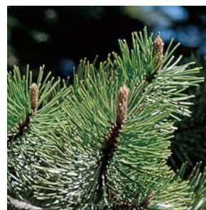
Above: Ponderosa Pines grow to more than 50 metres in height and from .9 – 2.4 metres in diameter. Stands cover approximately 11 million hectares of land in the United States. The large plates of orange-brown bark distinguish mature Ponderosa from other pines; needles grow in clusters of three.