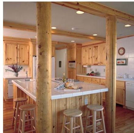
Living room: Ponderosa Pine doors, windows, moulding, panelling, soffits and fascia with clear finish to enhance natural colour and characteristics.